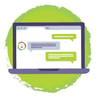
WebChat with us

Parents! For more information and resources, please check out our Kids Helpline parents section